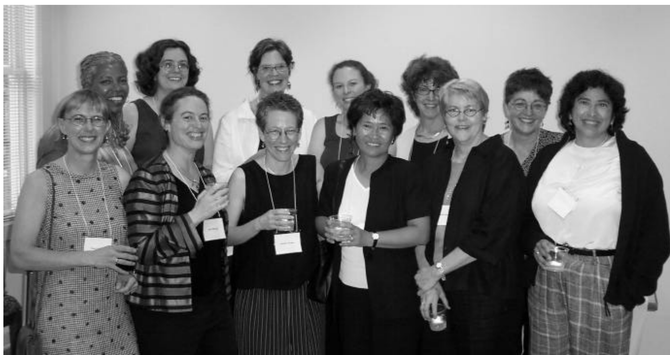
Participants in "Immigrant Women Organizing: Avenues for Collective Advancement"

The Institute gratefully acknowledges the Rockefeller Foundation's support of this symposium and the larger project "Gender, Race, Ethnicity: Rearticulating the Local and the Global."